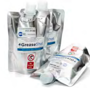
3 REFILL POUCH